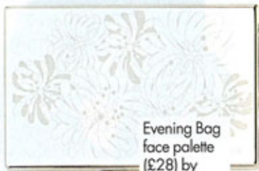
Evening Bag face palette (£28) by Paul & Joe