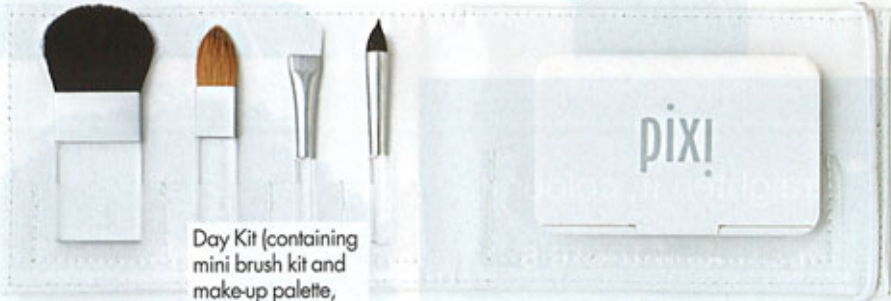
Day Kit (containing mini brush kit and make-up palette, £42) by Pixi