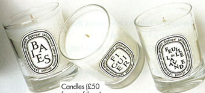
Candles (£50 for set of three) by Diptyque