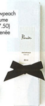
Snowpeach perfume (£27.50) by Renée