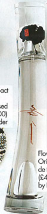
Flower Oriental eau de toilette (£43.50) by Kenzo