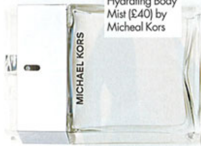
Hydrating Body Mist (£40) by Michael Kors