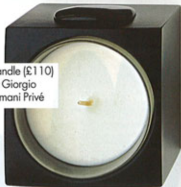
Candle (£110) by Giorgio Armani Privé