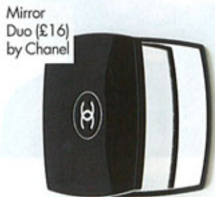
Mirror Duo (£16) by Chanel