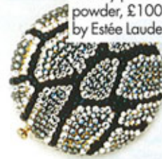
Python compact (containing Lucidity pressed powder, £100) by Estée Lauder