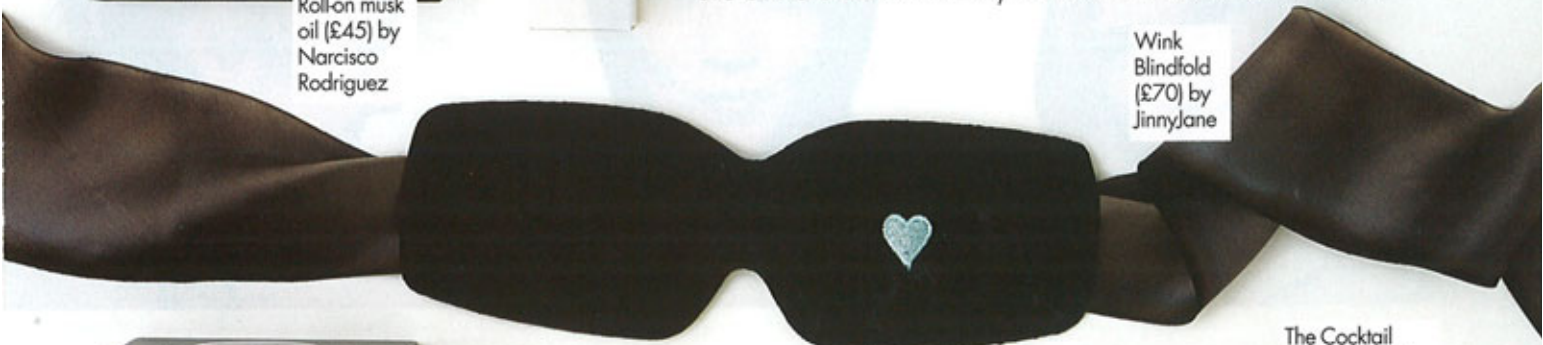
Wink Blindfold (£70) by JinnyJane