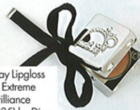
Play Lipgloss in Extreme Brilliance (£35) by Dior