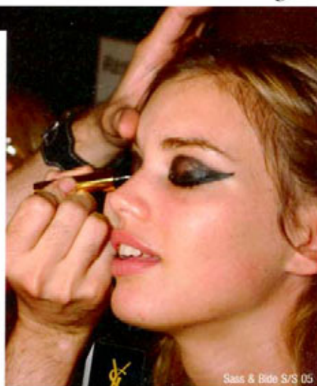
Sass & Bide S/S 05

I am a fan of liquid eyeliner. Don't get me wrong, I'm not talking about those bad 90s, " I'm so Audrey Hepburn " wings, some folk still won't quit it with. I'm talking a nice, subtle line, without any flicks and flourishes, just to give a little definition. Therefore, when liquid liners come in different colours like the new Pure Colour Eyeliner from Estée Lauder , I think it's newsworthy. Available in Pure Black, Plum Cassis, Brown, Khaki and Indigo, the colours glide on easily, and unfortunately, or fortunately (depending on your stance) are all too easy to flick and kick with. Estée Lauder Pure Colour Eyeliner $44.