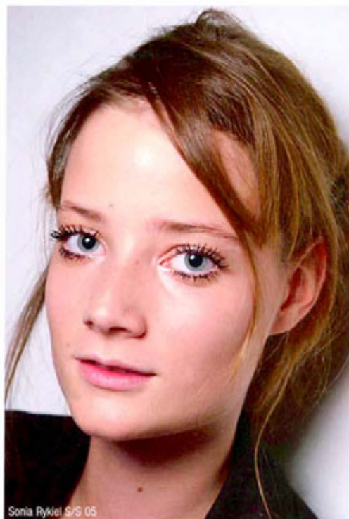
Sonia Rykiel S/S 05

gorgeous selection of gold, diamond and ruby colours would be a gem in any girl's stocking. Play with the fusion of colours contained in each palette to create sparkling highlights or heavy metal colour. Chanel Lumiere D'Artifices Eyeshadow $76